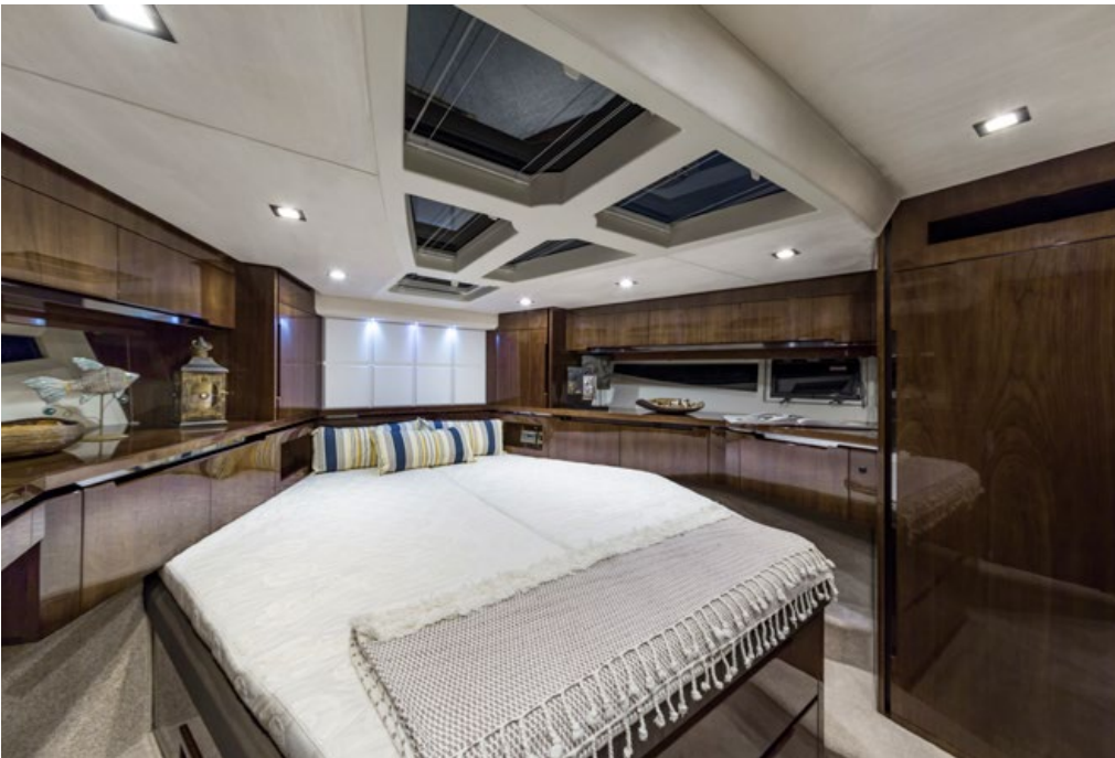
Find extra storage in all the cabins —