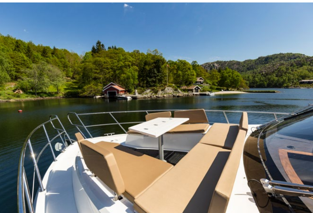
— The bow sundeck can be transformed into a rest or dining area