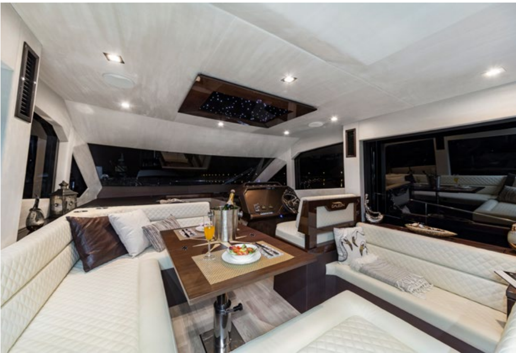
The dining and entertainment area with a pop-up TV —