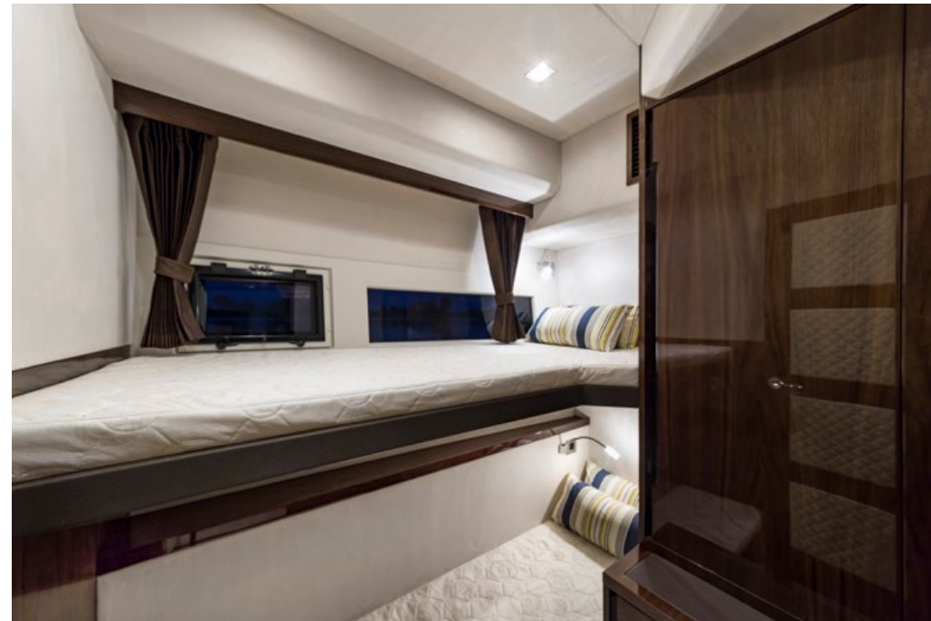
Bunk beds in the guest cabin —