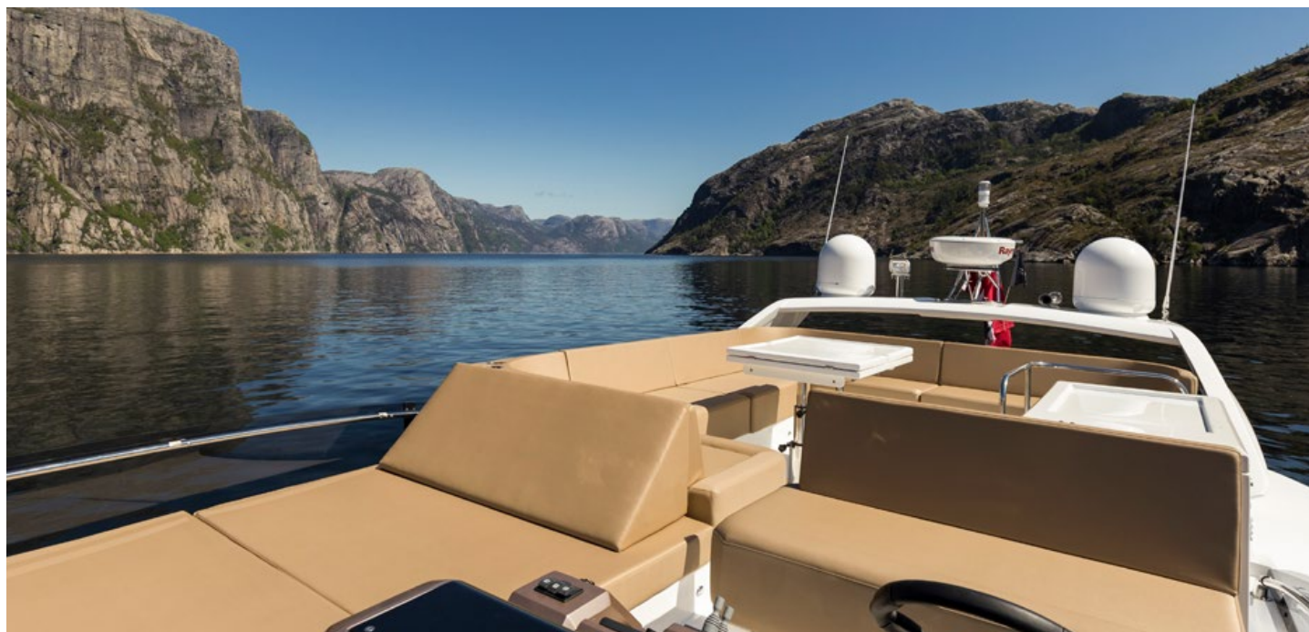
Great use of space on the flybridge —