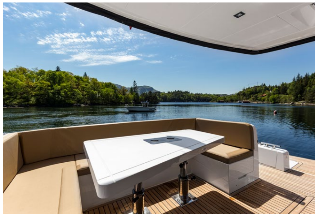
— Find respite in the cockpit