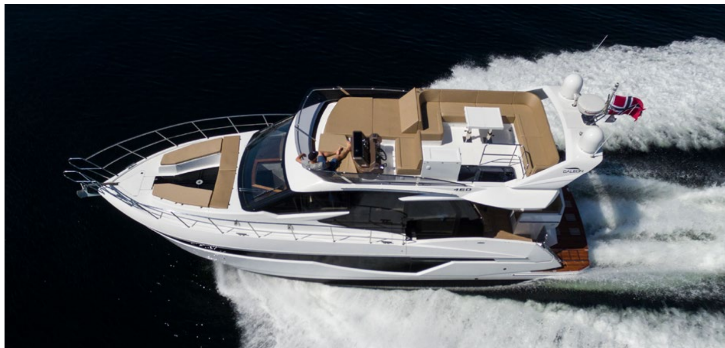
An incredible amount of space on the flybridge —