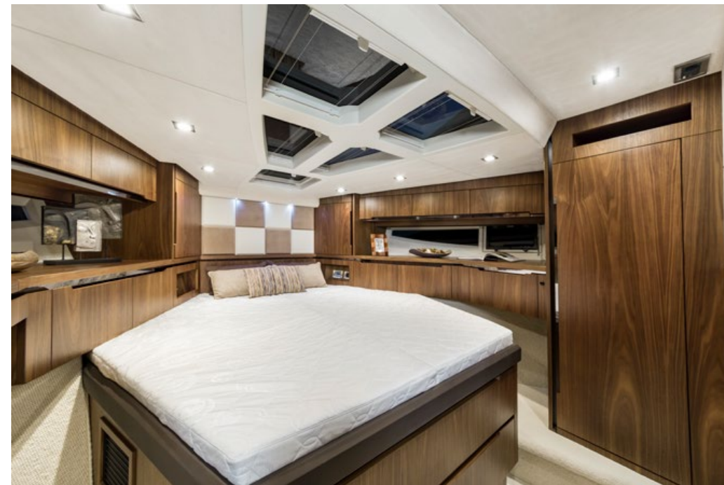
Forward VIP guest cabin —