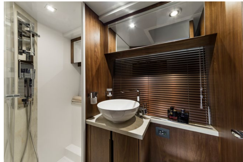
Bathroom with a separate shower —