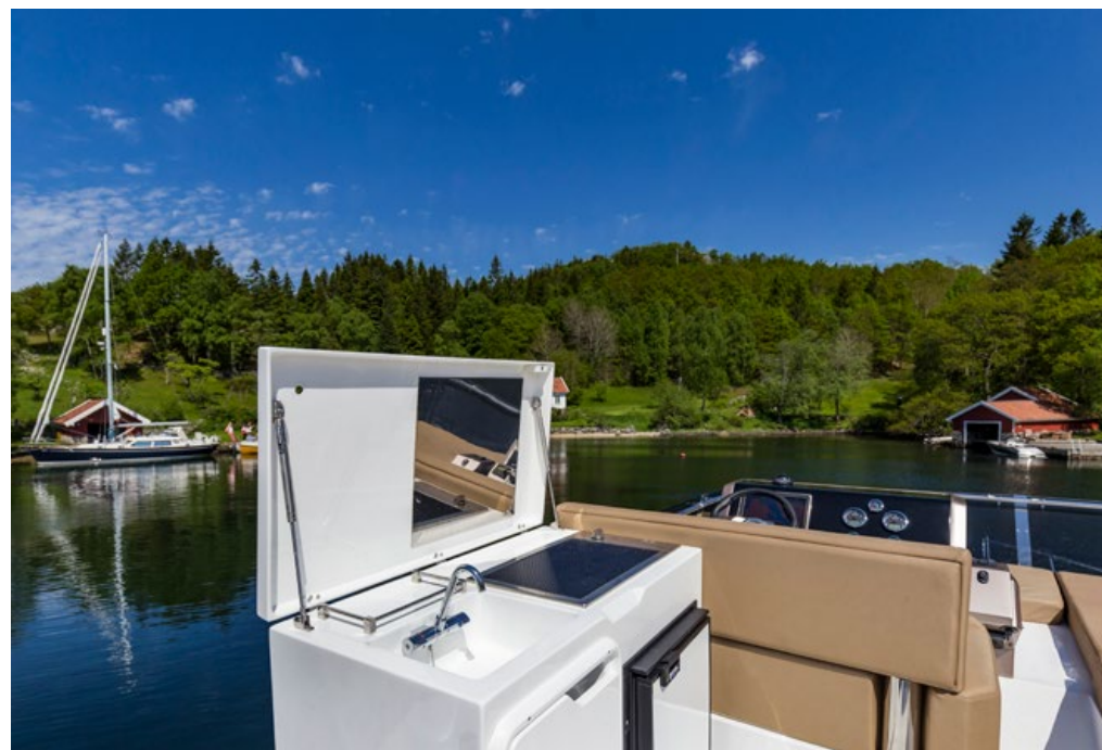
— Outside grill will surely come in handy