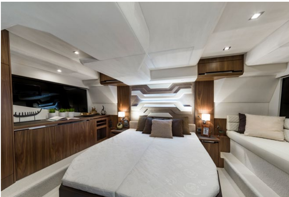
The owner's cabin offers incredible space —