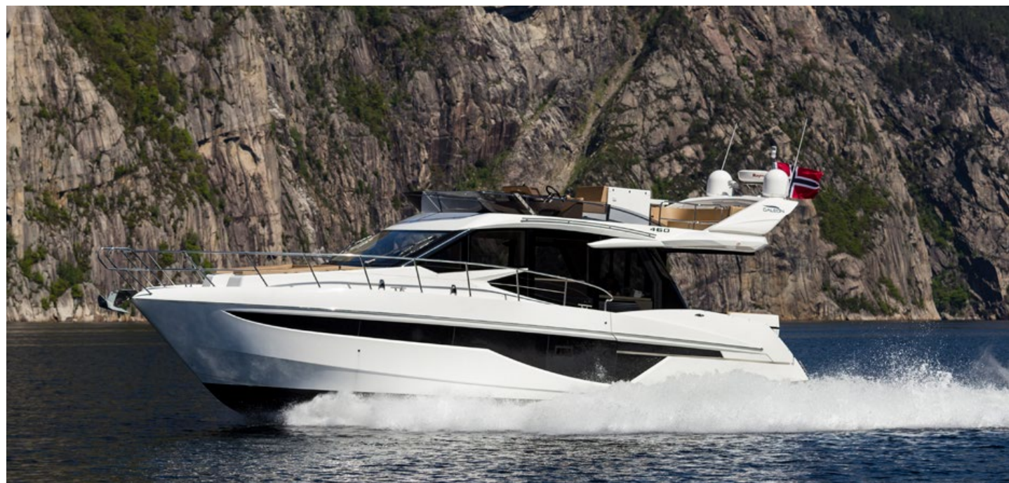
A dynamic yet balanced exterior —