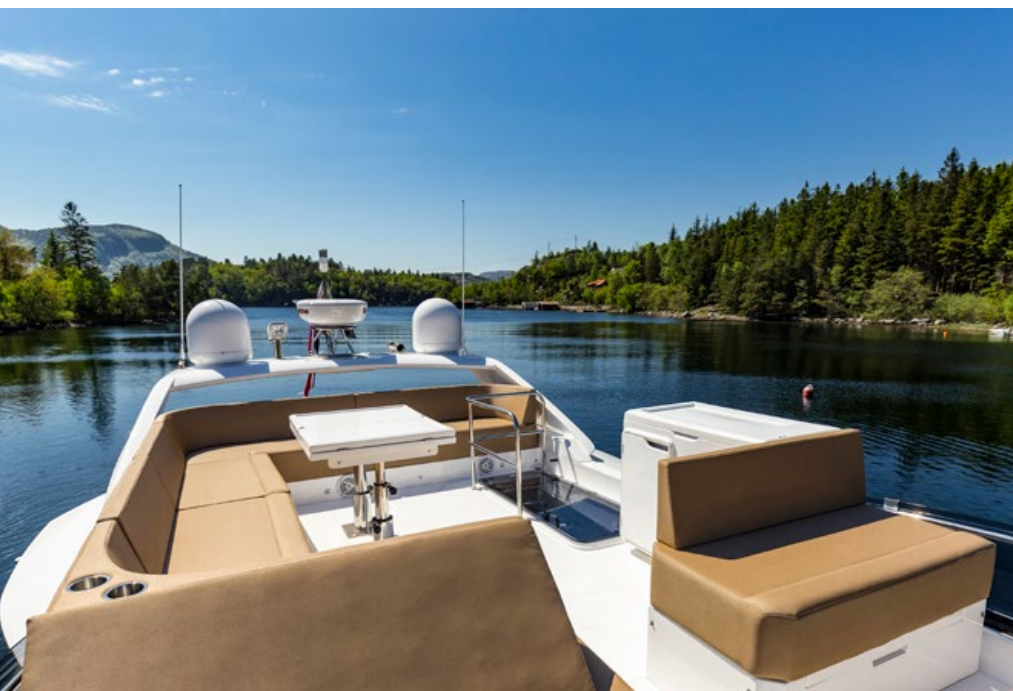
— Flybridge will seat plenty!