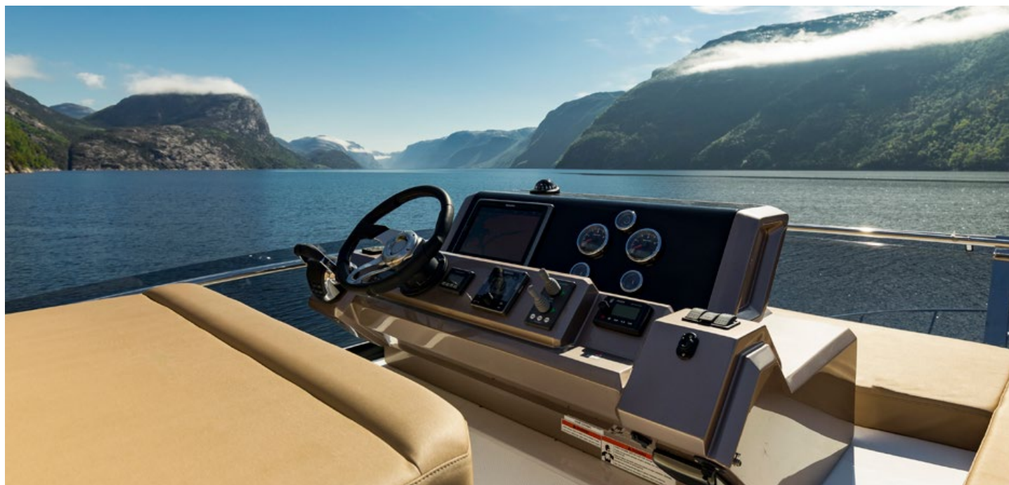
Have all the controls handy on the top deck helm station —