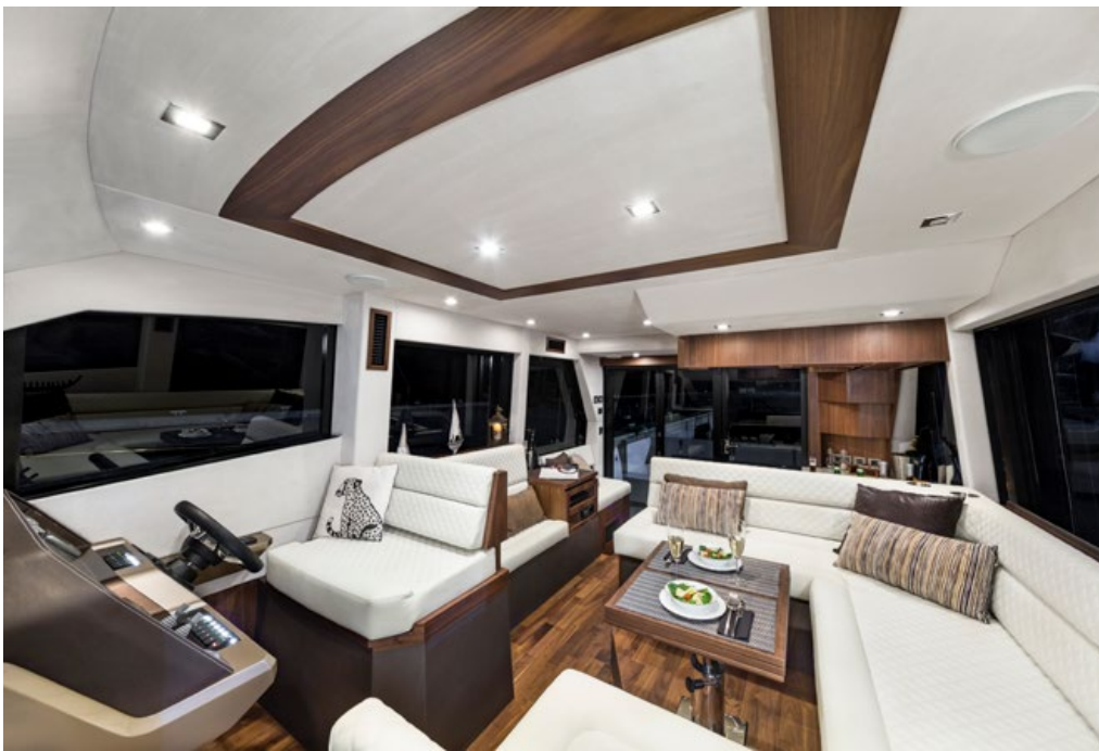
The front of the saloon is occupied by a large dining area and a helm station —