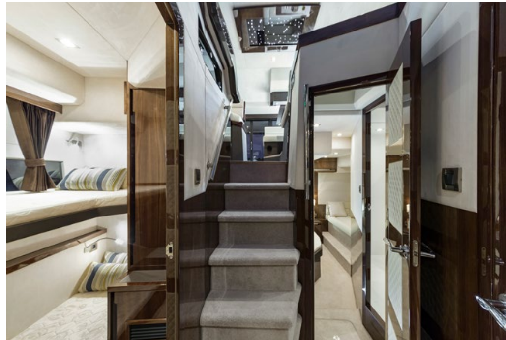
Three cabins are available down below —